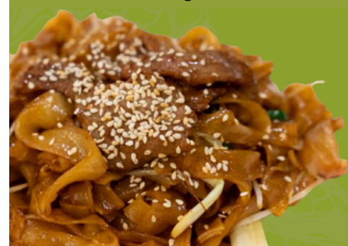
Flat Rice Noodles with Beef