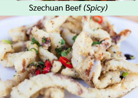
Salt & Pepper Squid