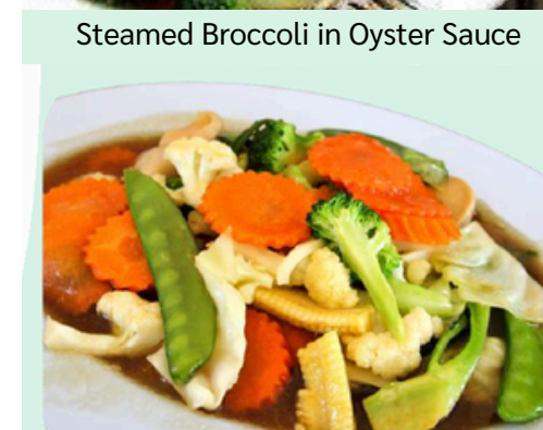
Stir Fried Mixed Vegetables