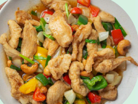
Chicken with Seasonal Vegetables in Garlic Sauce