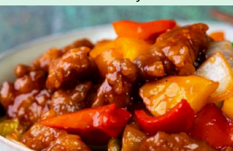
Sweet & Sour Pork