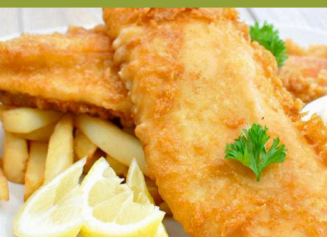
Beer Battered Fish & Chips