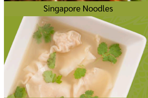
Short Soup (Won Ton)