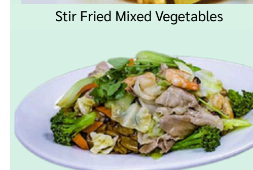
Combination & Vegetables