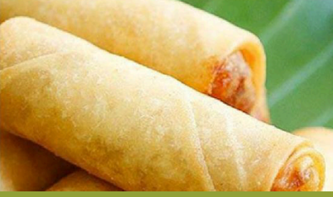
Vegetarian Spring Rolls