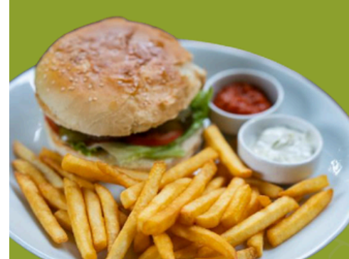
Cowboy Burger with Chips