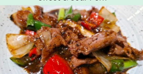
Beef with Black Pepper