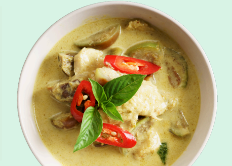
Thai Green Curry Chicken